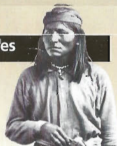
Nde (Mescalero Apache)

Nde (Mescalero Apaches), westward-bound pioneers, explorers, stagecoach drivers, U.S. Army troops, ranchers, and conservationists are all part of the colorful history of the Guadalupe Mountains. Until the mid-1800s these remote highlands were the exclusive domain of Nde, who hunted and camped here. Later came explorers and pioneers, who welcomed the imposing sight of the Guadalupe peaks rising boldly out