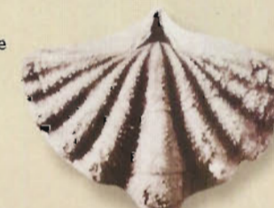
Brachiopod fossil of the Guadalupe Mountains SMITHSONIAN MUSEUM

parts of the reef are exposed in the Apache Mountains and the Glass Mountains (see map at left).